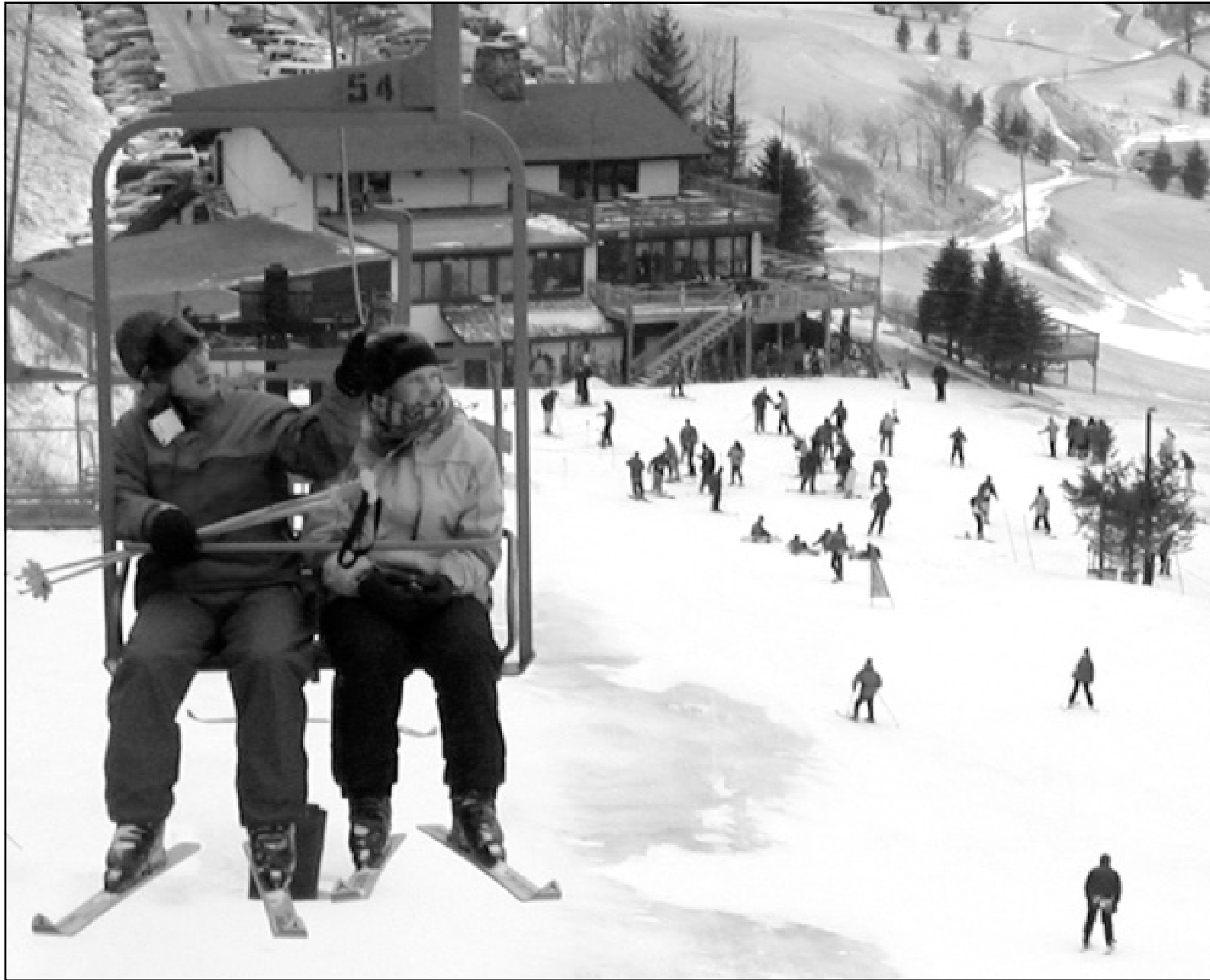
Hawksnest Golf & Ski Resort attracts skiers from all across the High Country and adjacent areas. Many mountains offer day and evening sessions.