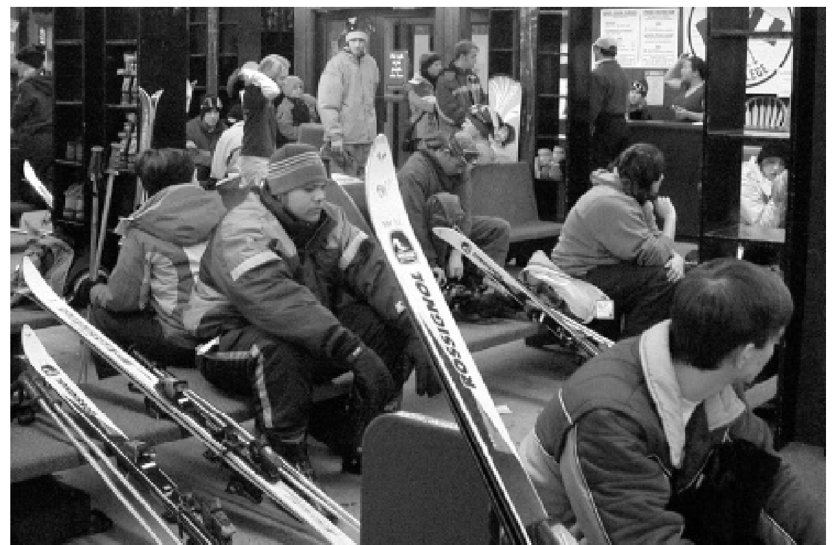
Foster Hunt | The Appalachian

Beech Mountain only allows those six years old and older to