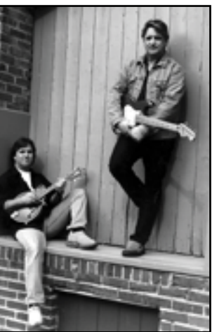
Carter Brothers Band returns to Boone Entertainment, Page 5