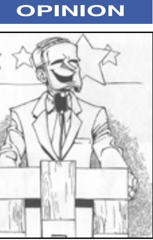
Where do current Republican intentions lie? Opinion, Page 7