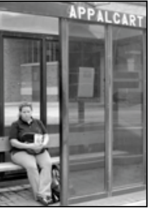
AppalCART hopes to keep same schedule In Focus, Page 4