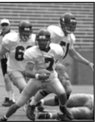
Football campaign begins Saturday at Division 1-A Wyoming Sports, Page 6