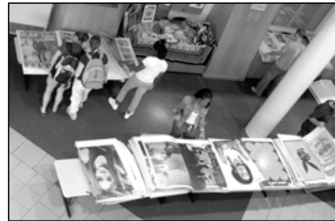
The poster sale had to restrict posters that could be sold.