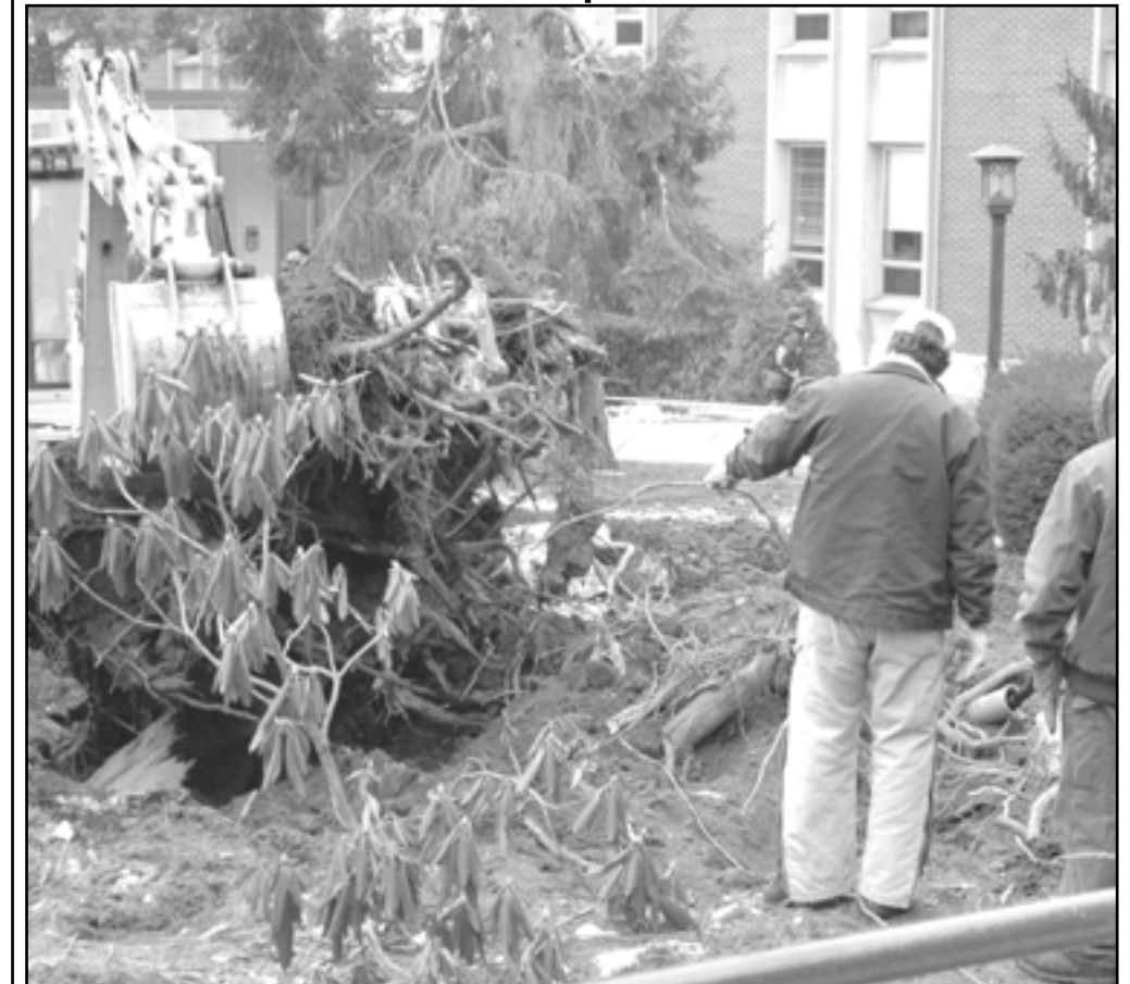
Trey Allman | The Appalachian

Physical Plant workers work tediously to remove a tree stump without further damaging an exposed cable. The stump is a left-over from the winter blast of two weeks ago.