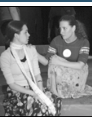
Modern touches brought to ancient tragedy 'Antigone'