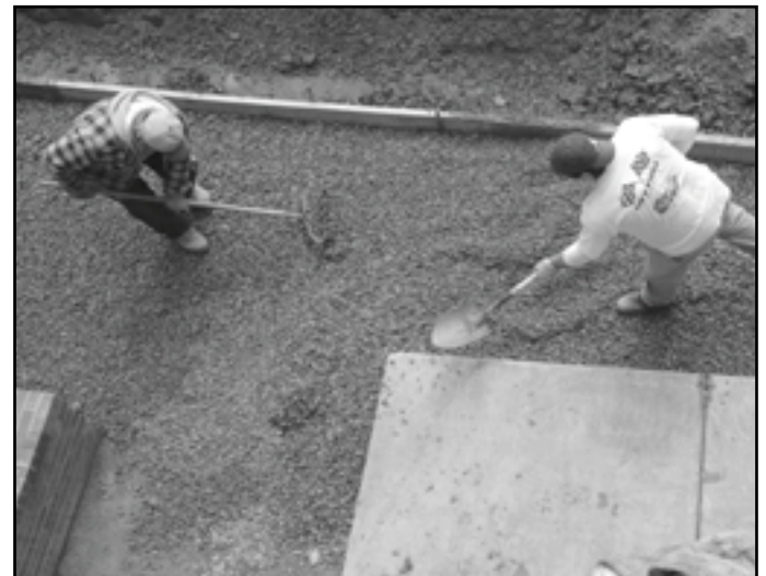
Construction crews are working on new gravel walkways around White Residence Hall.