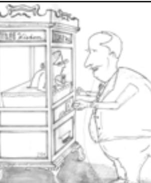
Doctorate not needed for Phil's type of advice