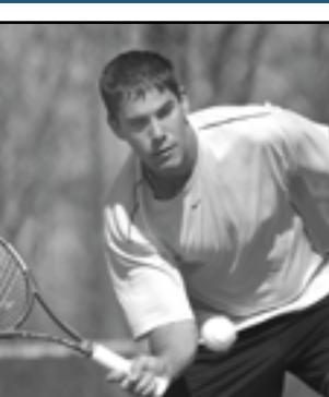
Hurley simply untouchable, flings no-hitter; tennis drops pair