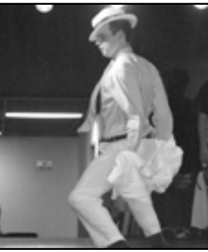
Standing out from the crowd